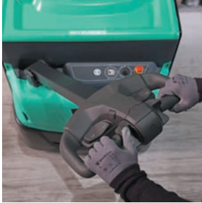
Easy-to-operate tiller arm