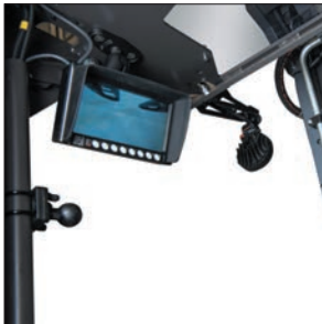
Level assistance system (LAS)