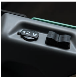
12V DC Power Socket