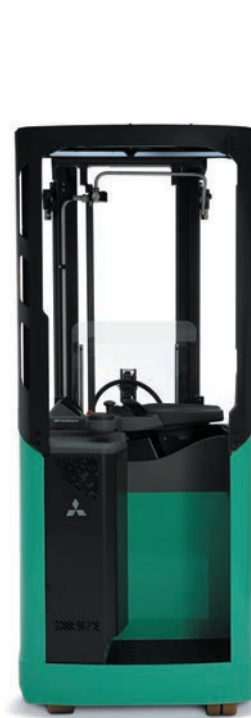
AXiA EX • SBR16N2

With capacities up to 2 tonnes, stand-in and sit-on stacker models are a lower-cost option when lifting up to 7m as reach trucks can often be over-specified for these jobs.