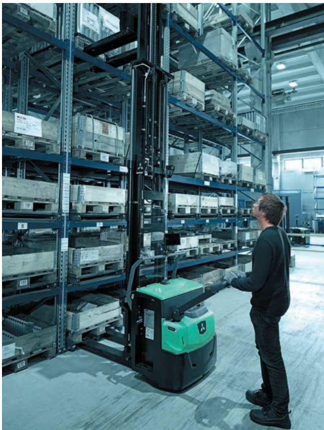
AXiA ES SBP10-16N3(I)(R)(S) & SBP12N2C Series