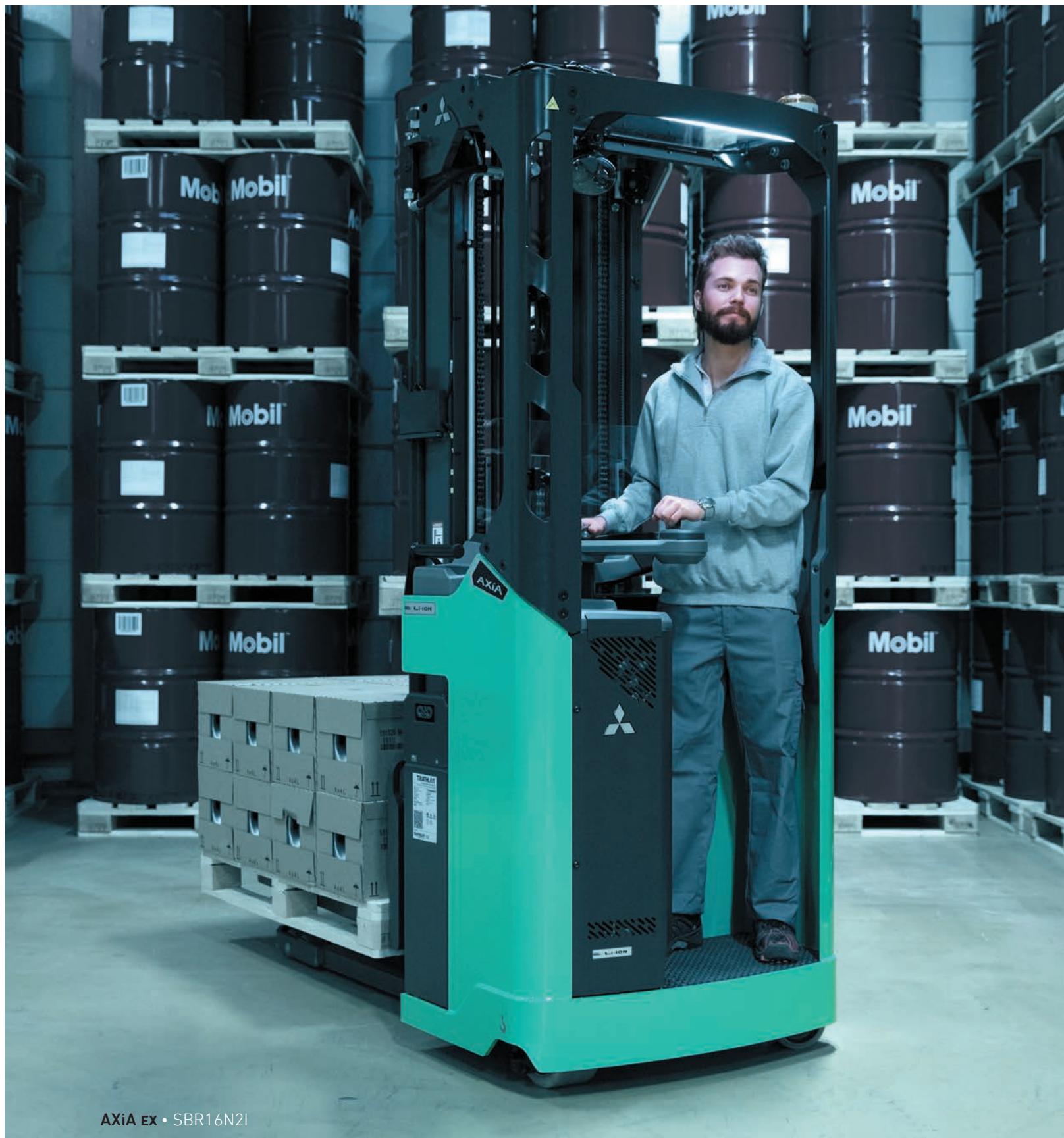
AXiA EX • SBR16N21