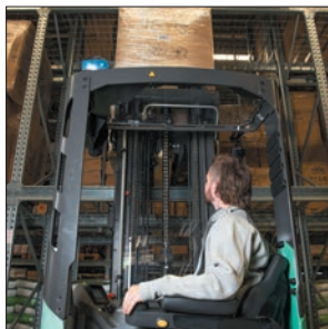
Panoramic ProVision roof