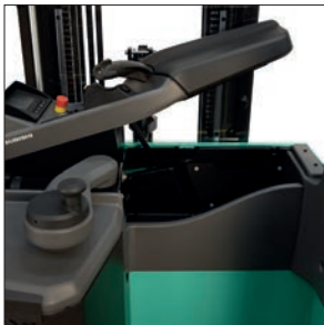
Adjustable armrest storage