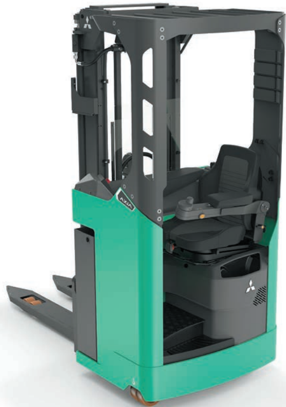
AXiA EX • SBS16N2