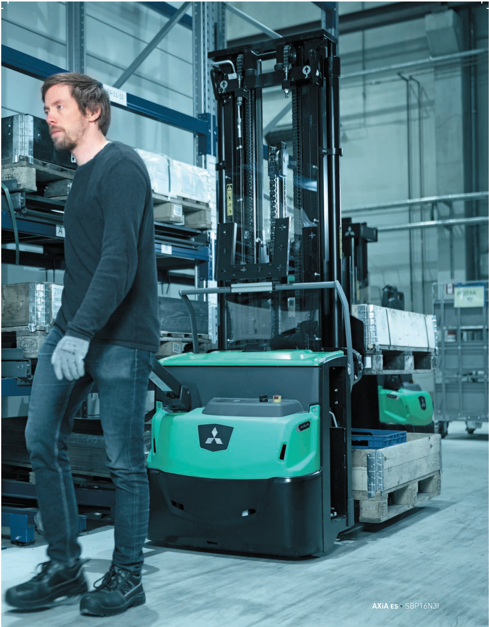
AXiA ES • SBP16N3I