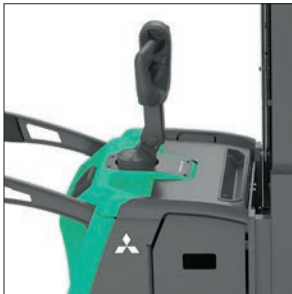
Conventional tiller arm