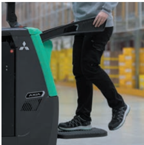
Foldable side bars (Option)