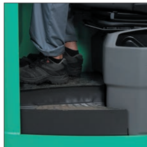
Adjustable floor plate