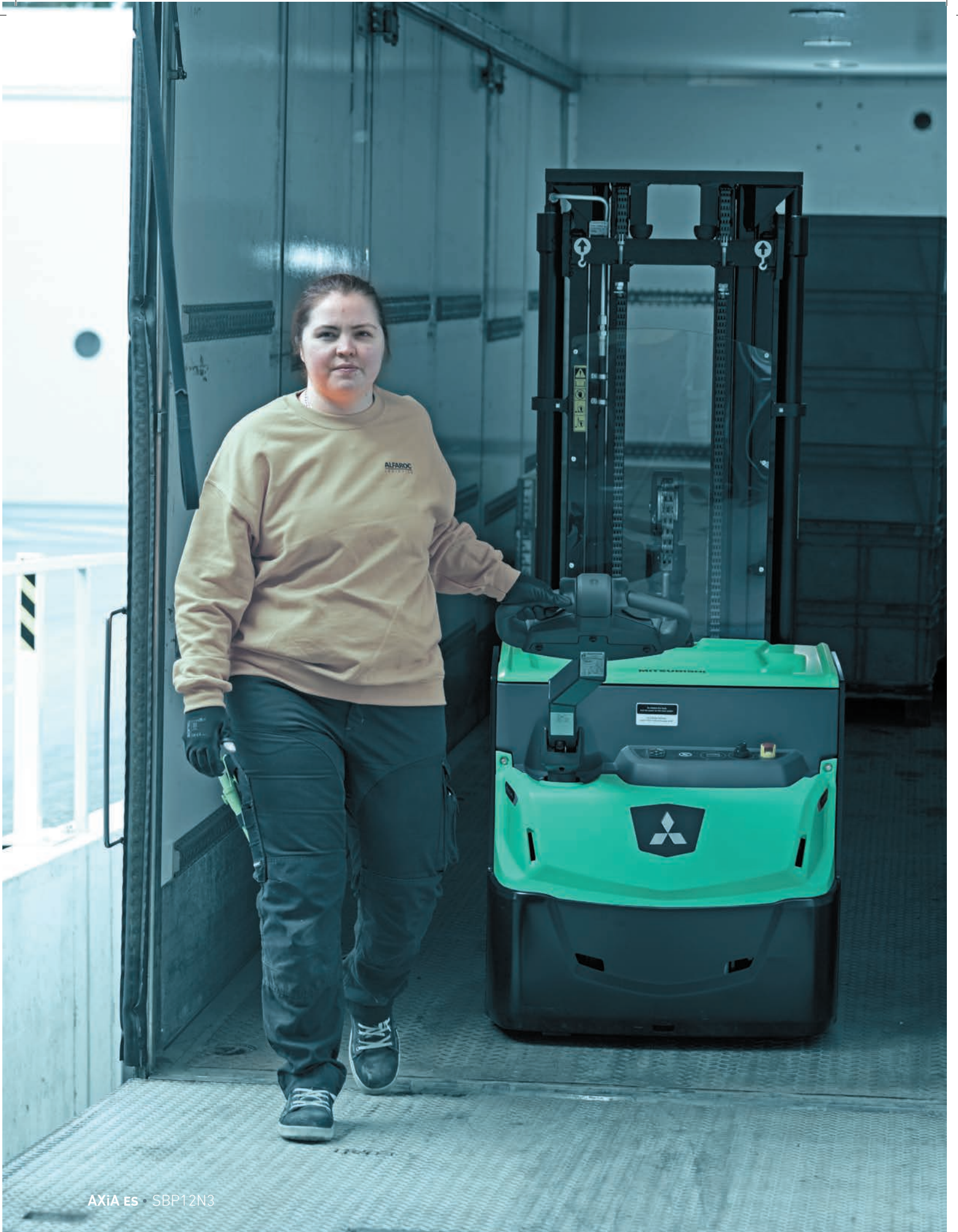
AXIA ES · SBP12N3