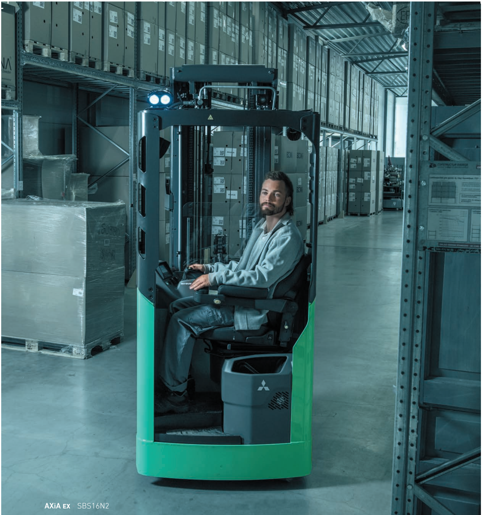
AXiA EX SBS16N2