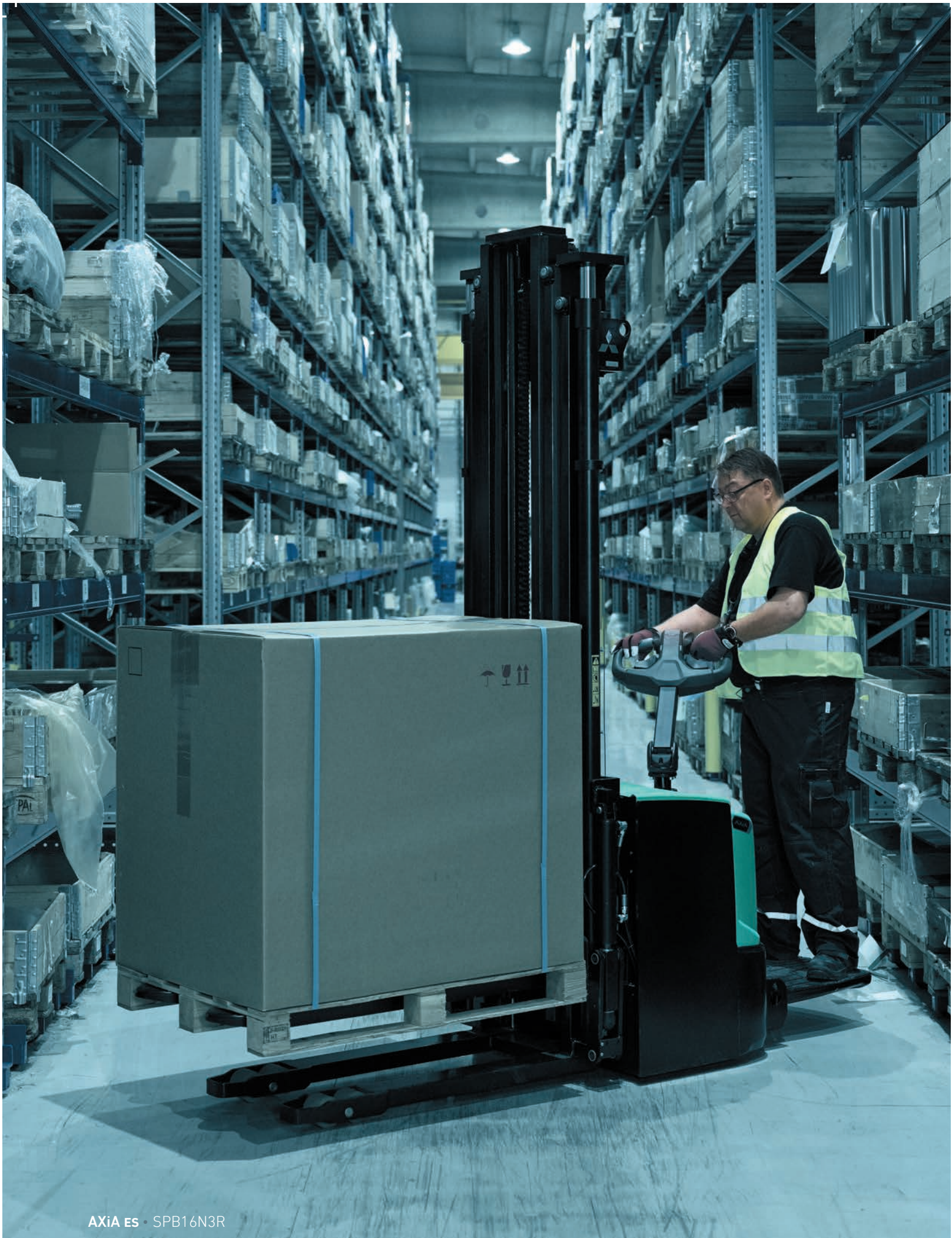
AXiA ES · SPB16N3R