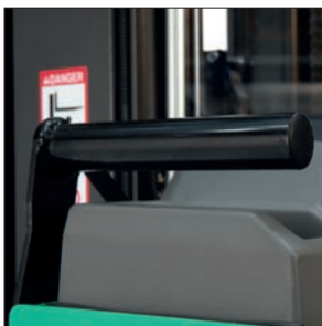
Dashboard protection accessory rack (mini)