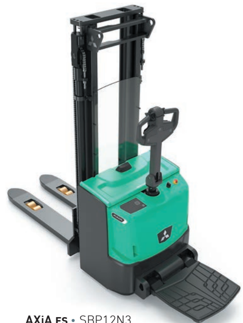
AXiA ES • SBP12N3