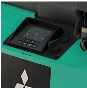
Multifunctional display (SBP12N2C)