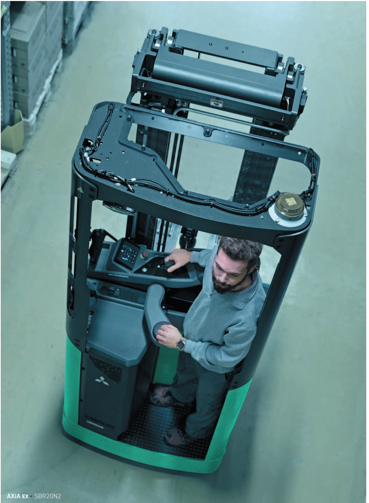
AXiA EX · SBR20N2