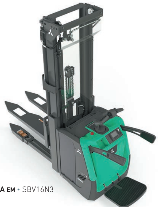
AXiA EM • SBV16N3

This allows for better ground clearance on ramps, inclines, and uneven floors, and allows for double pallet handling. (I models only)