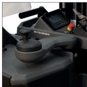
Adjustable steering wheel