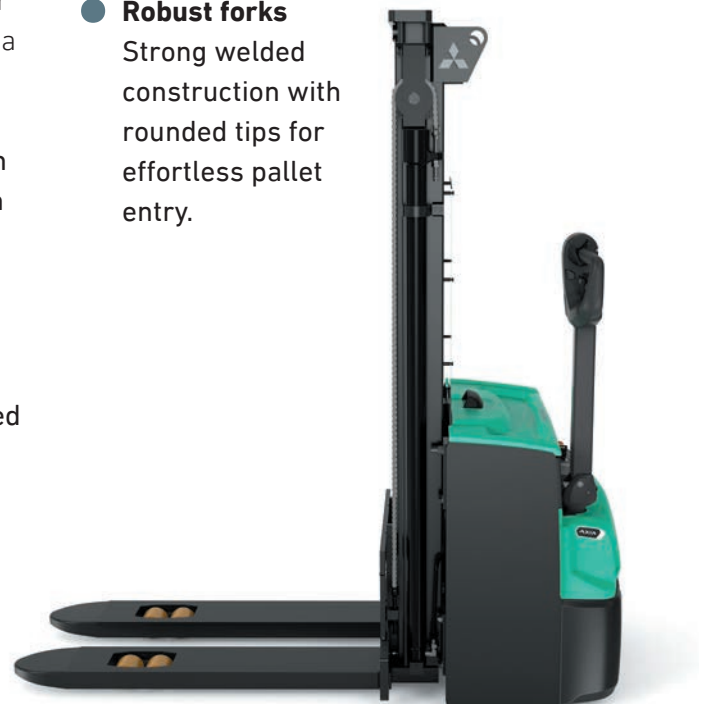
AXiA ES • SBP12N3