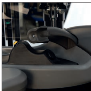
Ergonomic handle with drive control