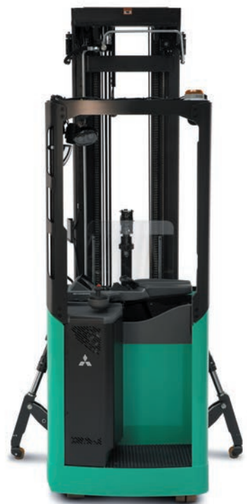
AXiA EX • SBR20N2