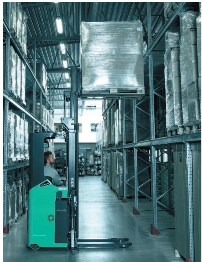
AXiA EX SBS16-20N2 Series