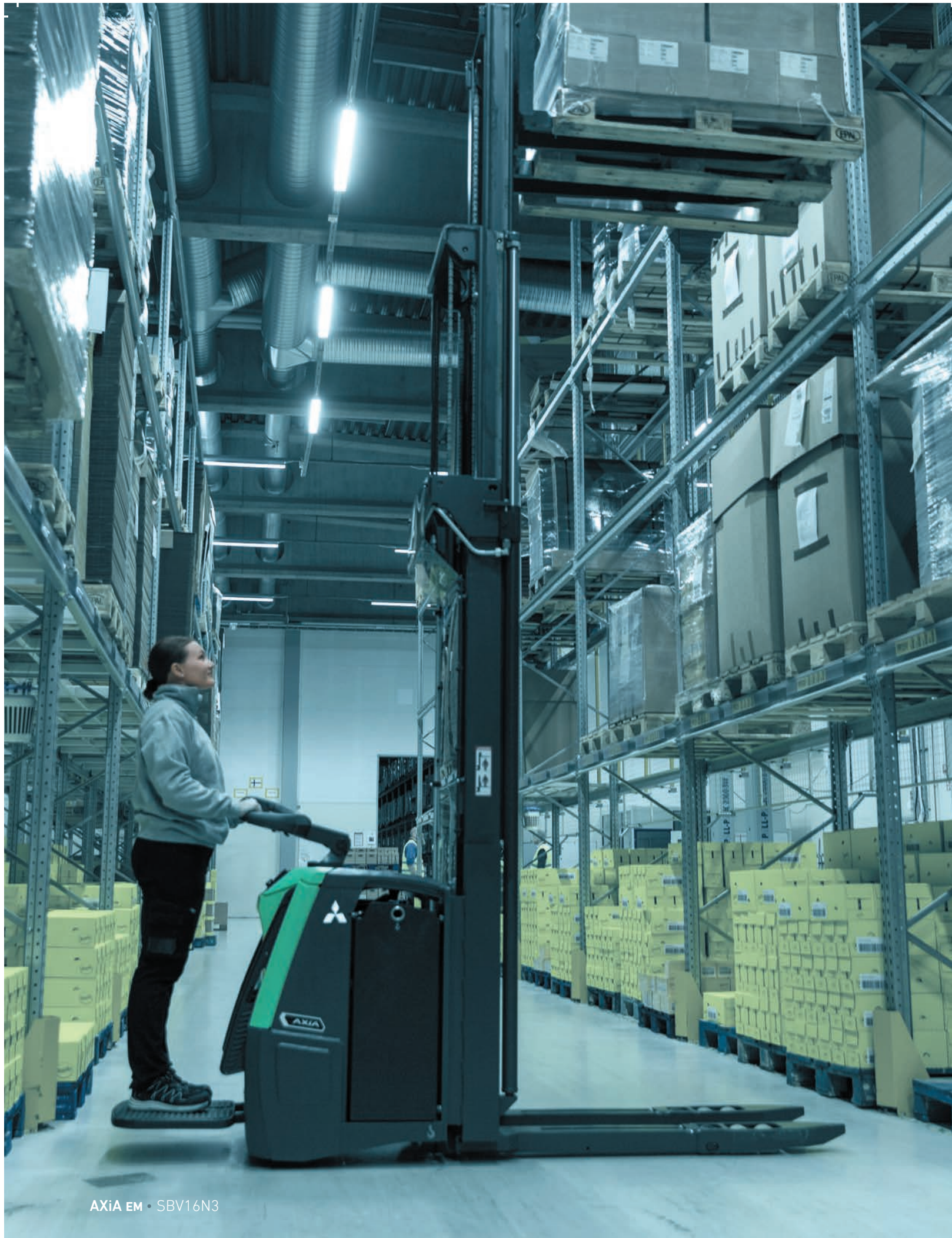
AXIA EM • SBV16N3