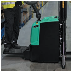
Folding platform & side stabilisers