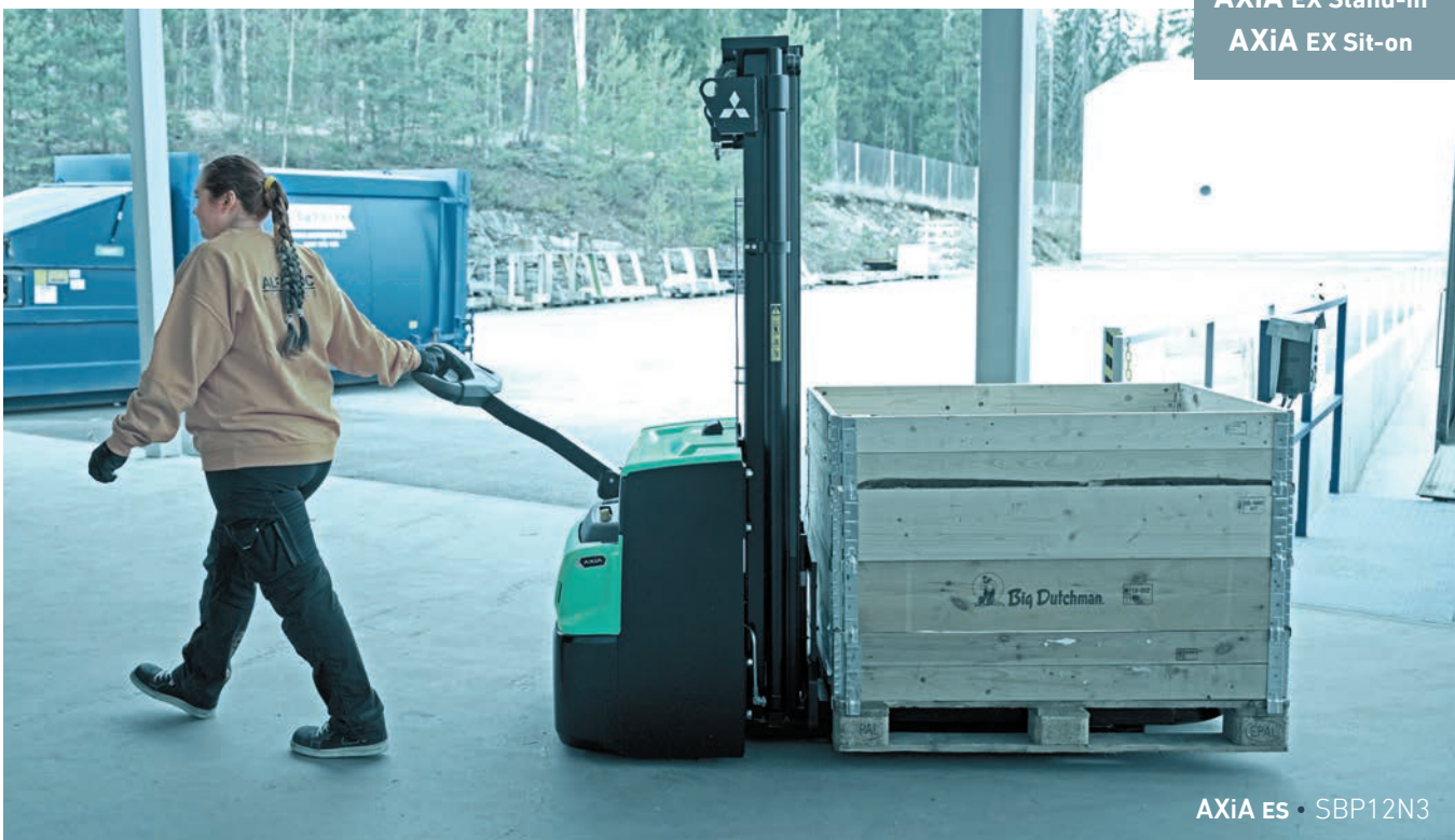
AXiA ES • SBP12N3