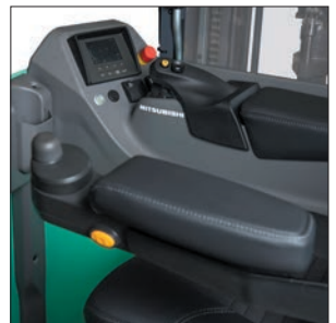
Mini steering wheel with floating armrest