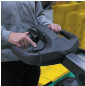
Ergonomic ErgoSteer tiller head