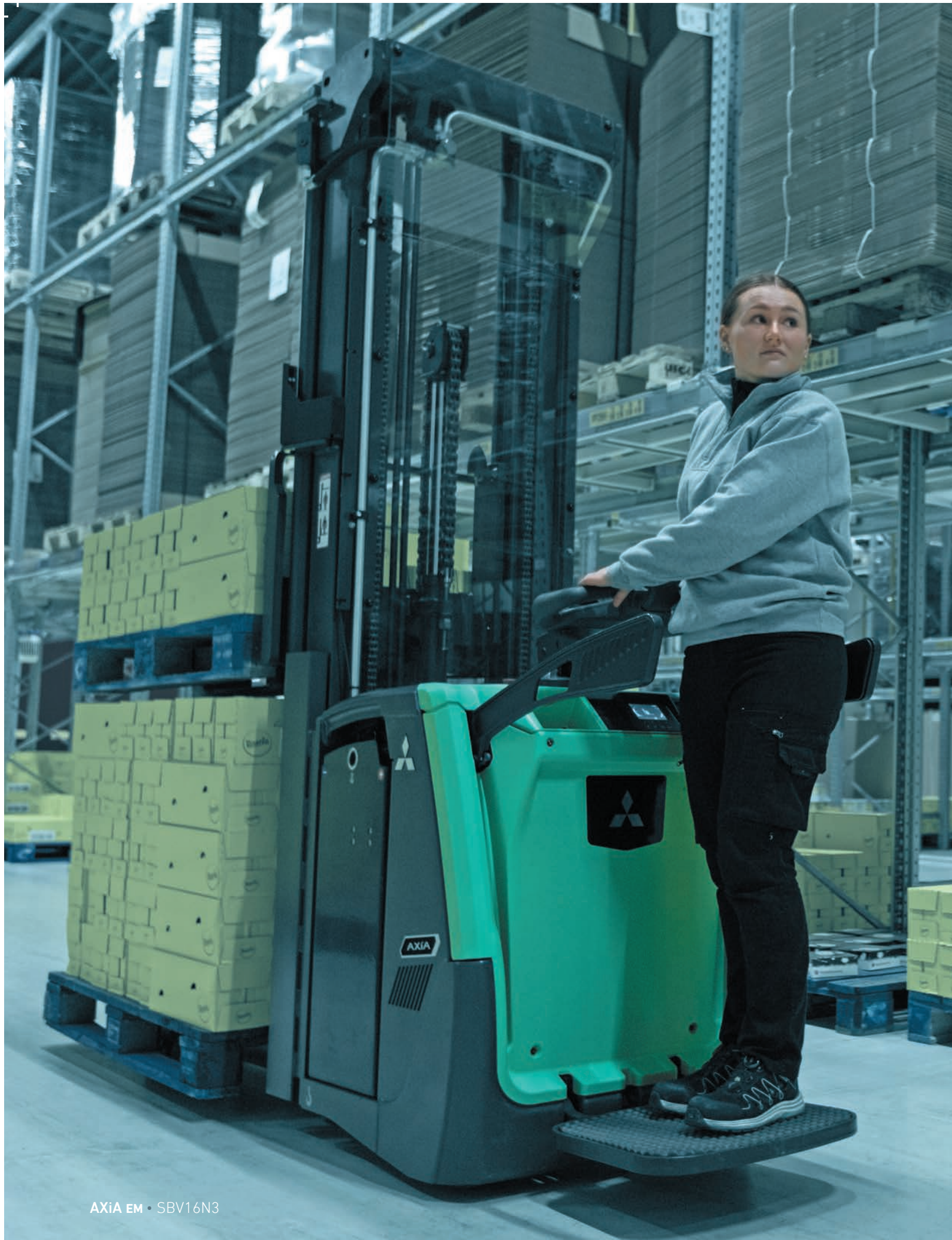
AXIA EM • SBV16N3